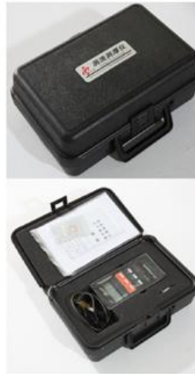
Aluminum Profile chrome layer thickness testing