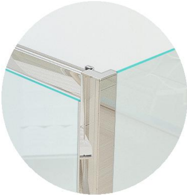
Quality Crafted Chrome Alu.profile