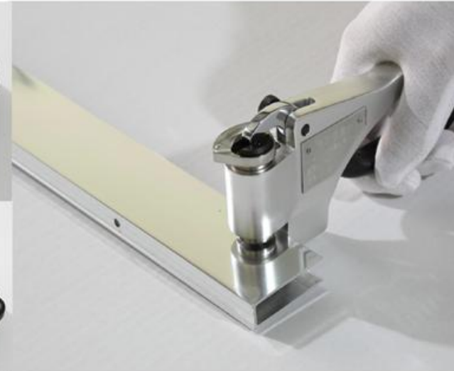
aluminium profile hardness testing