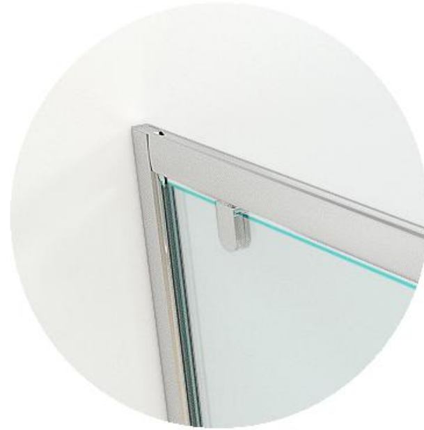
Quality crafted Zinc Pivot Hinge