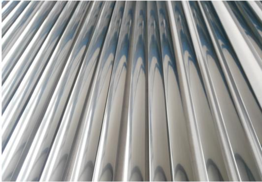
Aluminum Profile Chrome gloss/ brighting testing