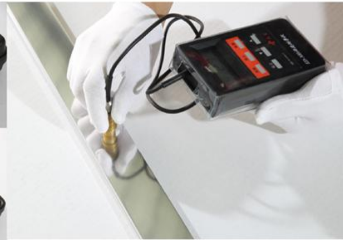
aluminium profile chrome layer thickness testing